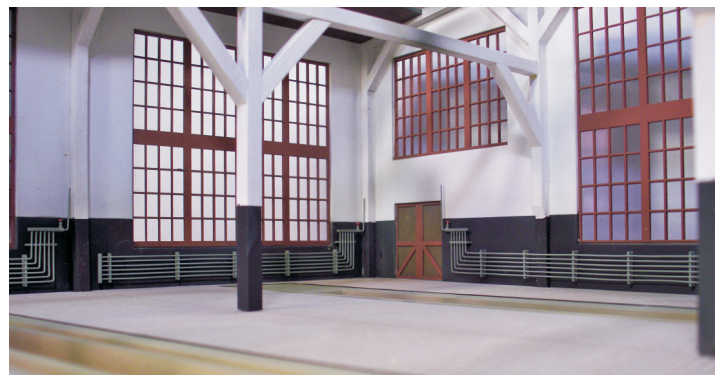
Steam Heating Pipes