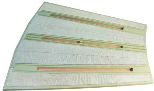
Custom CNC cut base from MDF then rail slots cut for your type rail. Optional scribe wood floor.