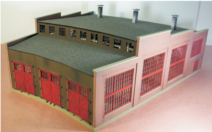
Base Kit 3 Stall Round House